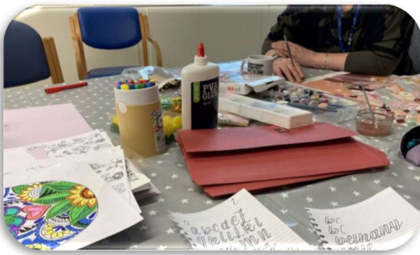
Art materials for Adult Mental Health Team