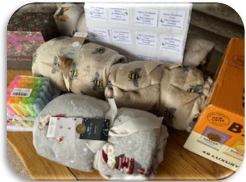
Christmas presents for patients