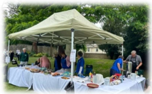
Band Concert event